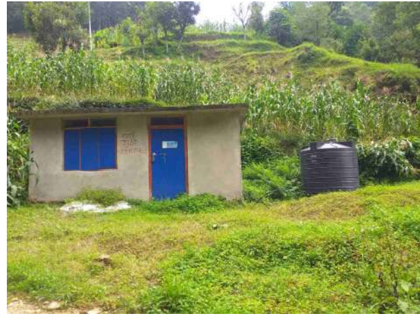
Fig 2: generator house and tank