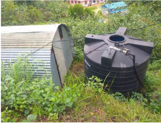
Fig 1: lifting tank and pump house.