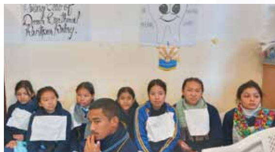
Yearly Dental Project for Schools with RC Denver, Colorado